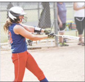
Blazin' Angels prep for state PAGE 5