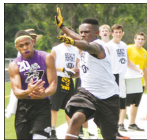
Sealy Football tries out 7-on-7 PAGE 6